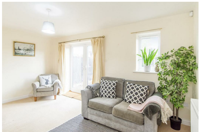
Lounge 13'5" x 12'4" (4.11m x 3.78m )

This lovely lounge has a window to the rear aspect and a set of French doors open into the garden.