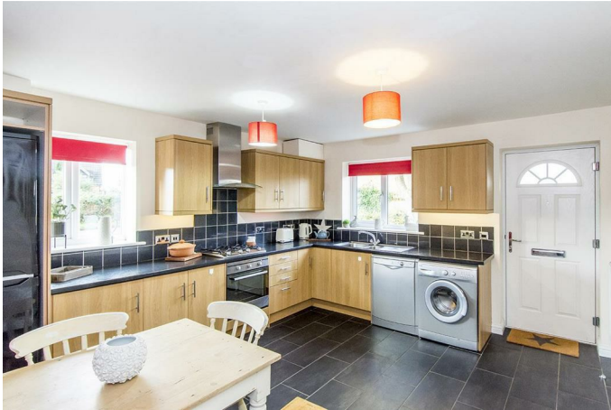
Dining Kitchen 13'5" x 12'4" (4.11m x 3.78m )

A composite door opens into the spacious dining kitchen which is fitted with a wide range of modern cabinets with complimenting surfaces. Stainless steel sink unit with mixer taps. Built in oven, gas hob with extractor. Plumbing for a washing machine and space for a fridge -freezer. Ceramic tiled flooring, under stairs cupboard and radiator. Dual aspect windows to the front and side.